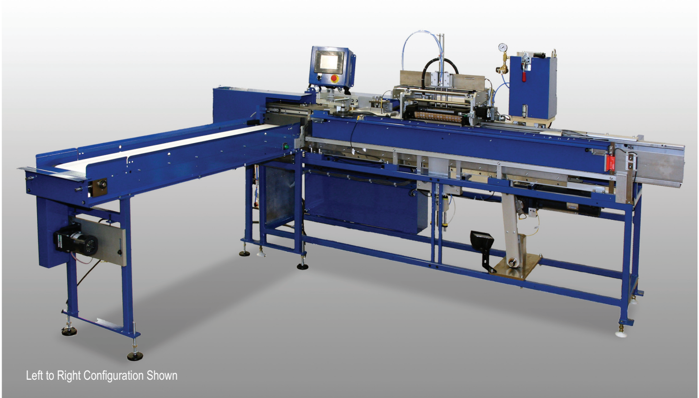
Left to Right Configuration Shown

Meyercord's VL-10 Tax Stamp Machine gives you quality and flexibility for the future. Ideal for both pre- and post-stamp operations, this machine requires no height adjustments - no more batching sizes ever again! Stamps Regulars, Kings, 100's, 120's and some promotional packs. The VL-10 utilizes a proven stamp head with superior stamp quality transfer. The uniquely designed stamp cartridge makes loading stamps easy and fast - ideal for multi-jurisdiction stamping. Simple to train, easy to operate, and requires low maintenance - the VL-10 Stamp Machine is ideal for your operation.